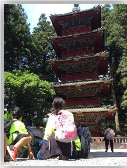
Nikko Field Trip